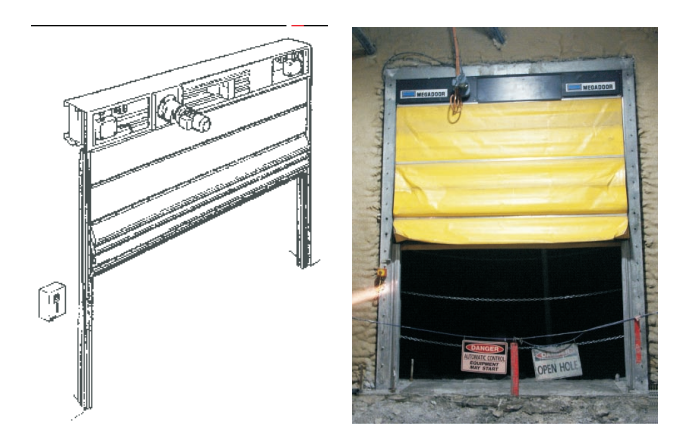
FIG 1 - Schematic and photographic views of a roller door regulator.

One of the Queensland operators has, in parallel with the project, developed an automated system for control of airflow. This involved the use of a robust 'roller-door' form of regulator that can be remotely operated from the surface (Figure 1). Differential pressure is measured across each regulator and through understanding of regulator impedance, a quantity flow's value is derived. Mine control operators are able to set regulators to deliver recommended Mine Level flows. Prior to blasting all regulators can be to be opened and then reset at the beginning of the subsequent shift. The system also reports gas concentration levels in mine air passing through each regulator. Gases sensed are carbon monoxide, nitrogen oxide, nitrogen dioxide and sulfur dioxide.